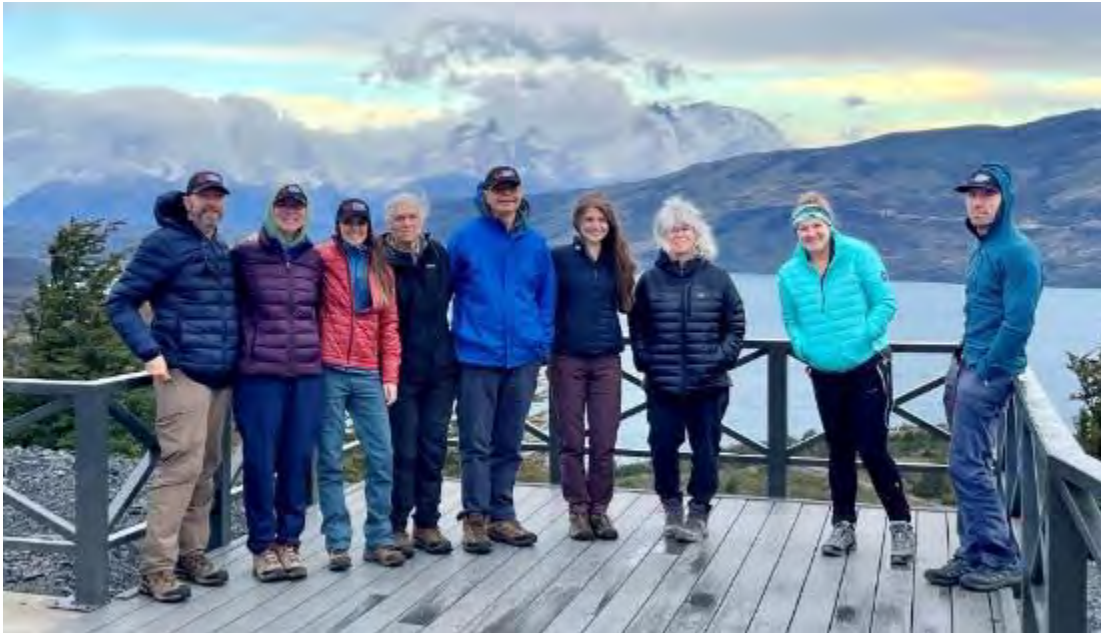
Figure 1: March 17 – ConservationVIP March 2026 Volunteer Group Photo at Mirador Grey