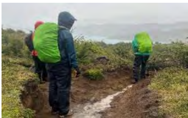
Figure 29 (Lower Right): A team pauses construction of a new water bar to smile for the camera – rain and mud did not deter great progress!