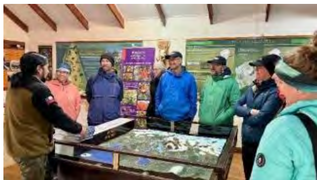
Figure 41: Park Superintendent addressing the group.

The group awoke to their final morning at Paine Grande, and to Patagonian weather in full force! Gusting winds, heavy rain, and hail made for a gray start to the day. A bit nervous that heavy winds would halt the catamaran's daily operations, the group was reassured that it would run without issue – and it did. Bracing against sleet as the group transported all gear and belongings to the boat, the ride was surprisingly smooth, and pockets of blue sky made an appearance. The group enjoyed their final journey across Lago Pehoé. Upon disembarking, the group was greeted by a light dusting of snow! Fall had arrived.