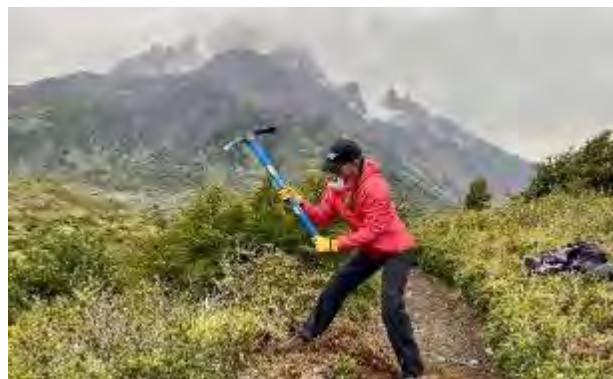
Figures 24-25 (Left-Right): Travelers begin construction of new water bars, cutting into established banks.

The group saw the first of “true” Patagonia weather this day – a mix of rain, sun, wind, rainbows, and even a small dusting of snow on nearly peaks!