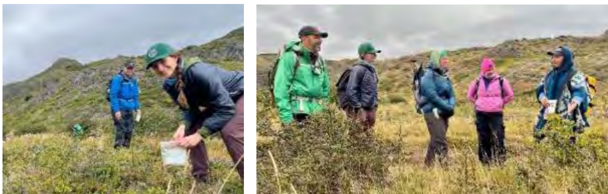
Figure 17 (Left) ConservationVIP travelers collecting seed.