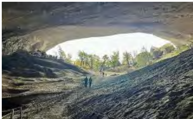
Figure 42: View from inside the largest Milodon cave

The group checked in to the Natalino Hotel for their final night. Everyone enjoyed time to refresh before meeting for one final dinner together, a traditional lamb barbecue ( Figure 43 ). As a special thank you, Pablo Sanhuesa was invited to join for dinner. The group enjoyed a final evening together, having come full circle from where they began.