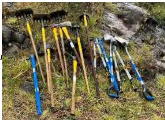
Figure 19: Many of the project tools

After lunch, it was time to switch gears! First stop was the Paine Grande Ranger Station where Corporación Nacional Forestal (CONAF) had kindly stored ConservationVIP's tools. The tools had been coordinated ahead of time by Trip Leaders, together with help from Legacy Fund and CONAF. Tools for the next few days' projects included shovels, pickaxes, pick Mattocks, Pulaskis, McLeods, loppers, and hoes ( Figure 19 ).