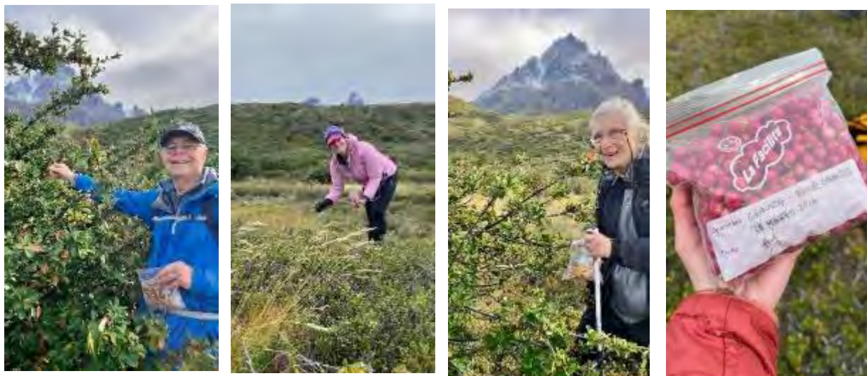
Figures 13, 14, 15 (Left-Right): ConservationVIP travelers collecting seeds.