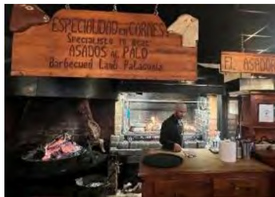
Figure 43: Traditional Lamb BBQ at El Asador