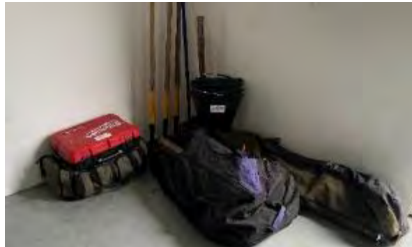
Figures 39-40: Tools laid out for inventory (Left), then organized and packed – ready for transport (Right)