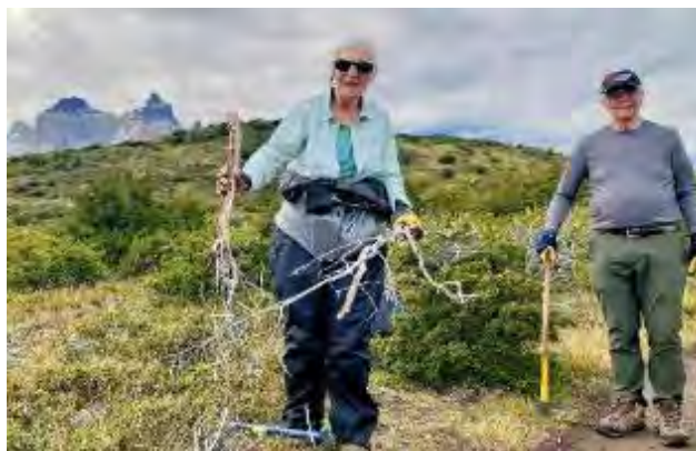
Figure 23: A team of 2 collects loose vegetation to aid recovery on closed off, braided trails.

As rain showers began to roll in, the group enjoyed lunch overlooking Skottsberg Lake. Tools and gear were then collected and the group hiked back towards the trail split, ready to move on to the next project area.