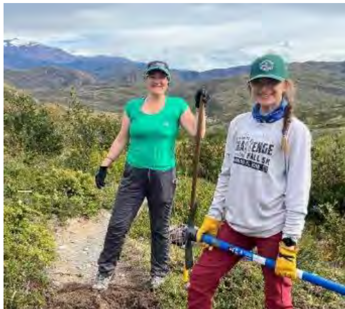
Figure 22: A team of 2 pauses construction of a new water bar

After breakfast, the group set out on the trail toward Italian Camp, pausing to collect tools stashed the prior afternoon. Leap-frogging up the trail in groups of 2-3 ( Figure 22 ) to locations flagged by the Trip Leaders, the group continued to construct new water bars and soon reached the turnoff point for Skottsberg Trail.