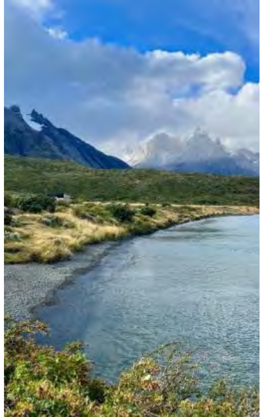
Figure 2: View of the park upon arrival by catamaran near Paine Grande

While in the Park, the ConservationVIP® group stayed at Refugio Paine Grande (Paine Grande), sharing six-person bunk rooms. The refugio provided cafeteria-style hot breakfast and dinner service, with bagged lunches for the trail each day. Situated at one of the main entry/egress points for popular treks, Paine Grande was filled with new travelers each day – a true melting pot of explorers from around the globe.