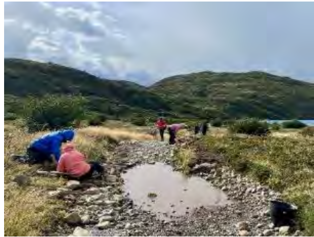
Figure 35 (Top Left): the group revegetates a widening section of trail.