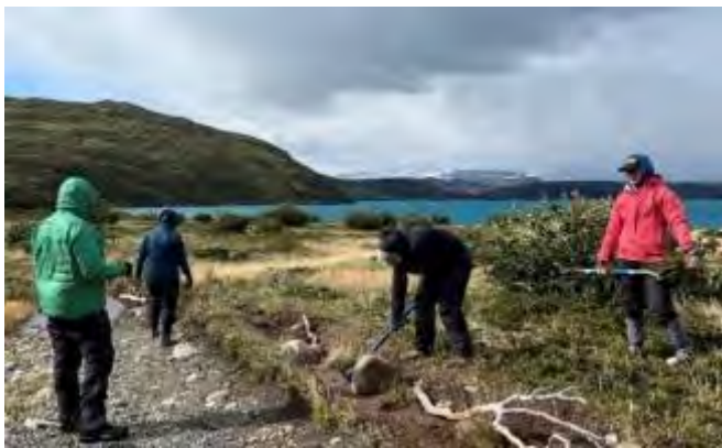
Figure 36 (Top Right): the group revegetates a puddle bypass and provides rock fill to allow the main trail to be passable.

In parallel, a team of two focused on widening and improving an undersized outlet at the end of a water pipe coming from the Ranger Station, alleviating backup and flooding onto the trail. Another group of two collected rocks to infill one of the deepest puddles ( Figure 36 ), creating a route for hikers to remain on trail, rather than continuing to erode the edges.