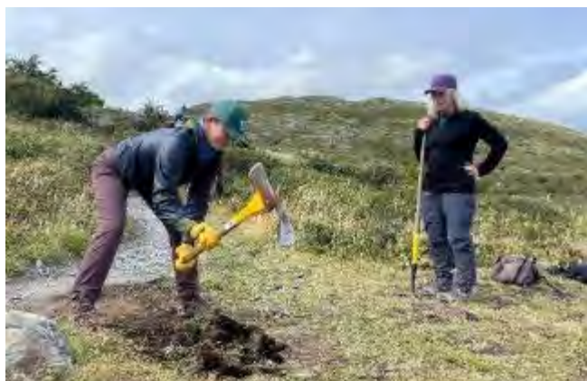
Figure 21: A team of 2 begins construction of a new water bar.

After a safety briefing on how to carry tools, the group proceeded about ¼ mile up the trail toward Italian Camp. There, the group gathered for a group stretch, in-depth safety tutorial about each tool, and an outline of the next project. This afternoon and for the next three days, the project focus was on construction of water bars. Water bars are a type of drain feature used to divert water off the trail. Diverting water is critical to prevent erosion of a trail system and keep hikers on the trail, for long-term sustainability and protection of the landscape. The projects offered the group the opportunity to learn how to place, construct and maintain these important trail features.