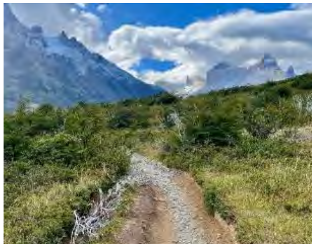
Figure 26: A section of braided trail is concealed by downed branches.

Sunday was a rest day so the group was treated to a well-deserved day off from volunteer projects. It was also the last day of spectacular weather before heavier rain and winds would come, so the travelers availed themselves of the opportunity to hike, explore, or rest. Most chose a hike to Británico viewpoint via Valle Francés (the French Valley) or hiked the full loop along Skottsberg to Italian Camp and back. Clear skies, low wind, and mid-70 temperatures ensured a beautiful and fulfilling day for all.