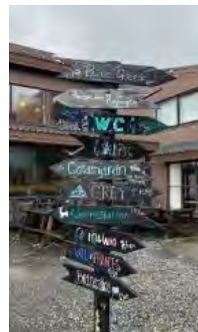
Figure 34: A sign at Paine Grande directs visitors to the many amenities and trails accessed from this location.

Given the high volume of visitors in and out of Paine Grande, areas directly in front of the refugio and Ranger Station needed maintenance and restoration. A few sections of trail had been identified by Trip Leaders earlier in the week as prime locations for recovery, if given a little TLC. Specifically, trail braiding and widening around puddles was just starting to occur in a few areas – vegetation was being worn and roots were exposed, but the plant life remained. These sections, if protected from further damage, would quickly regrow.