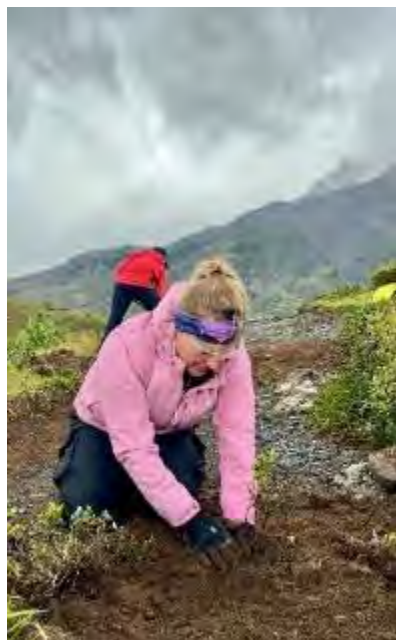
Figures 32-33 (Lower Center & Right): Newly constructed water bars