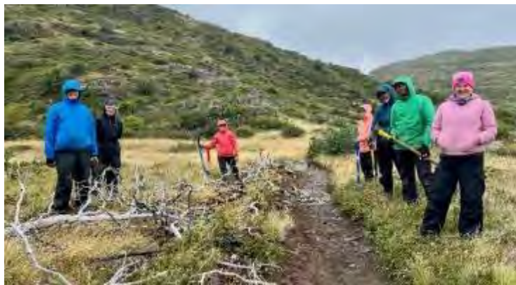
Figure 37 (Above Left): the group revegetates and conceals a newly worn bypass trail.

In parallel, a team of two focused on widening and improving an undersized outlet at the end of a water pipe coming from the Ranger Station, alleviating backup and flooding onto the trail. Another group of two collected rocks to infill one of the deepest puddles ( Figure 36 ), creating a route for hikers to remain on trail, rather than continuing to erode the edges.