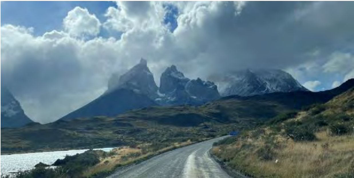
Figure 3: View of Torres del Paine massif from approach by transport van