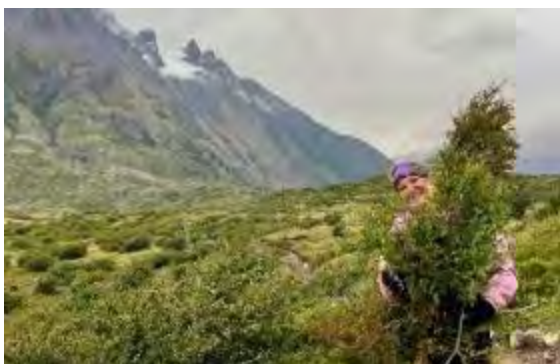
Figure 27 (Left): A ConservationVIP traveler removes cut branches after brushing a section of trail.

Returning to the location where tools had been stashed along the “old” trail to Italian Camp, the group continued installing water bars, brushing, and concealing braided tracks along another 1/4-1/2 mile of trail. Clouds loomed overhead most of the day, concealing the peaks and bringing the wettest day yet. With more rain came wet and muddy conditions! The group persevered and accomplished much. Smiles abounded as the group could see their water bars in action by the end of the day ( Figure 28 )!