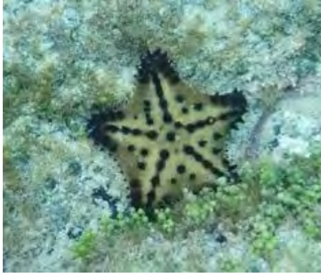
Chocolate chip Sea Star