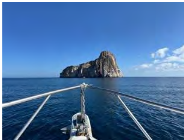
Kicker Rock (Sleeping Lion)

Upon returning to the boat, the group shared what they had seen and experienced. The sight of sharks, stingrays and such a large number of sea turtles was an amazing experience. A delicious freshly prepared lunch was then served on the boat.