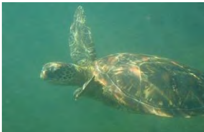
Galapagos Sea Turtle