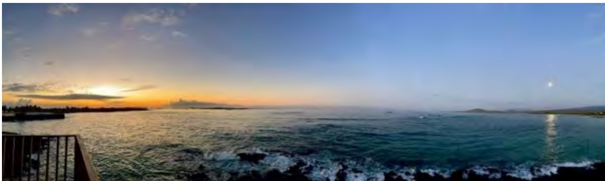
Sunrise in Isabela Island. Sun at left, Moon at right

Stopping at a mature mangrove area, guide Janina walked the group through a mangrove forest to a freshwater area and explained to the group more about mangroves and the key role they play in preventing loss of land mass during storms. Along the way, the group hiked up to the viewpoint where they had an almost 360-degree view of the island.