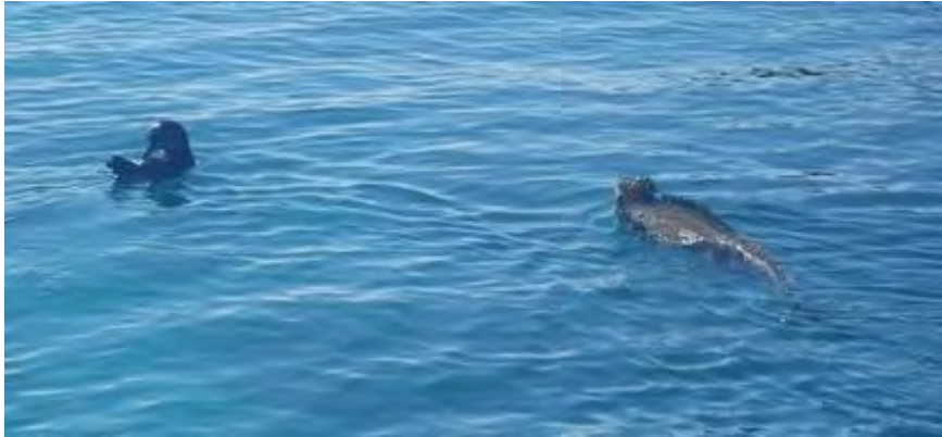
Galapagos Penguin swimming with Iguana

Today the group was shuttled by bus to the marina and boarded a boat to the Islet of Tintoreras where different forms of lava on the islands are found, and mangrove trees are more mature. Blue-footed boobies, lava egrets, crabs, and many adult and juvenile marine iguanas, and sea lions inhabit the area. During the boat tour the group saw several Galapagos Penguin (the most Northern penguin in the world).