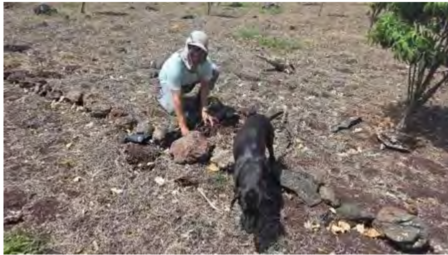
ConservationVIP Volunteers planting endangered native Lecocarpus Darwinii plants

The volunteers assisted with planting endangered Lecocarpus Darwinii plants. After the project, we enjoyed a delicious lunch of local food served under a pavilion on a hill with a beautiful view of the surrounding farm.