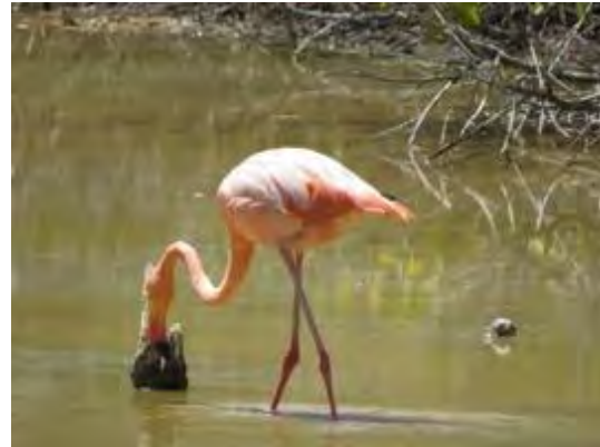
Flamingos at Isabela Mangrove

Stopping at a mature mangrove area, guide Janina walked the group through a mangrove forest to a freshwater area and explained to the group more about mangroves and the key role they play in preventing loss of land mass during storms. Along the way, the group hiked up to the viewpoint where they had an almost 360-degree view of the island.