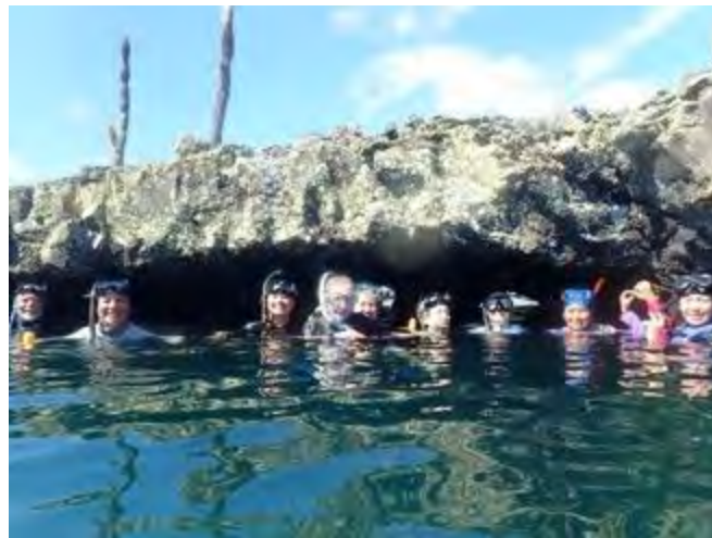
Snorkeling at Los Tuneles, Isabela Island