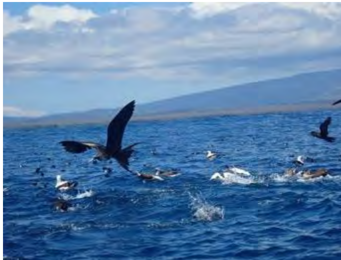
Frigates and Seagalls

After returning to the hotel the group boarded a bus to Campo Duro, which is an Eco-Camp located in the cooler, lush, tropical highlands on the slopes of the Sierra Negra Volcano.