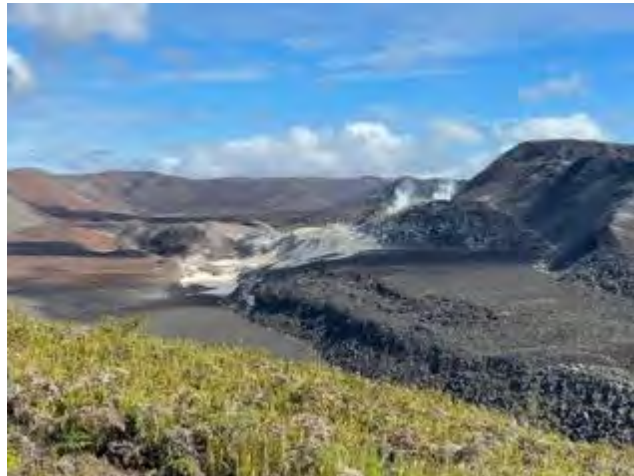
Volunteers at Volcano Sierra Negra, Isabela Island