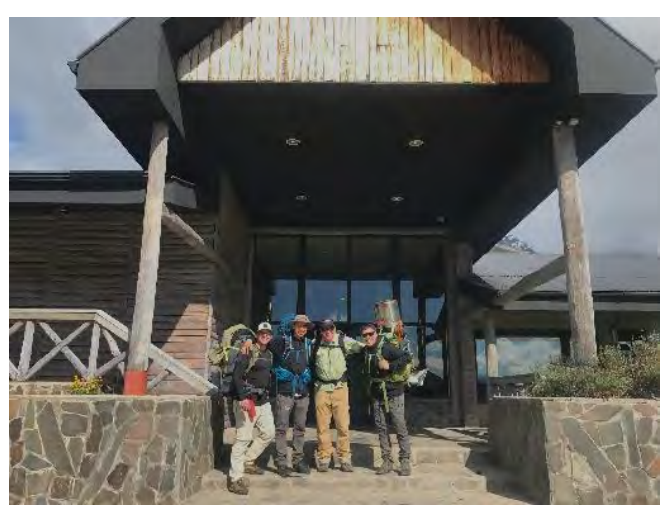
Base Torres Trail Builders

<u>Old Italian Camp</u>, located at the entrance to the French Valley on the very popular "W" hiking trail, was used as a campground for over 30 years. Although the campground was closed when a new Italian Camp was established 3 years ago, the old toilet buildings remained. Use of the bathroom facilities at the old camp had exceeded the capacity of the facilities and needed to be remediated. On this trip, there was a weeklong effort to begin cleanup at Old Italian Camp. Garry Oye developed a cleanup