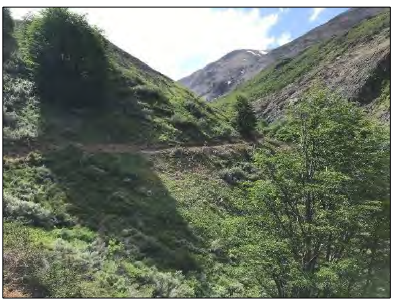
Base Torres Trail

The focus of the work on the Base Torres project on this trip was to continue working with local trail builders on the trail on Las Torres Reserve lands below Refugio Chileno. Since the construction of new trail on the Las Torres Reserve land began in February 2022, five km of trail have been completed, and three km are under construction with a projected completion date of April 2025. In order to open this new trail, Las Torres Reserve has planned three hard span bridges to be constructed in late 2025, which would allow a projected trail opening in January 2026.