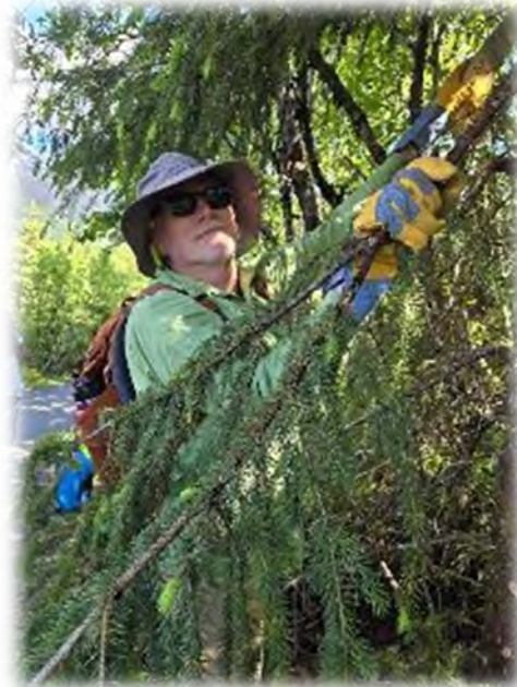
Leaders in action lopping and sawing Nugget Falls trail