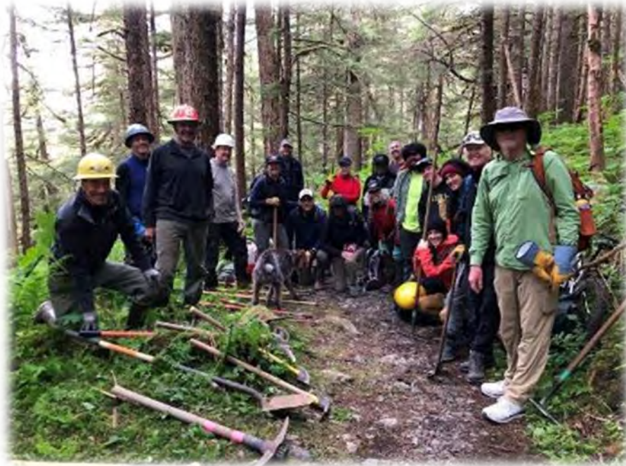
USFS, Treadwell Ditch crew and ConservationVIP volunteers