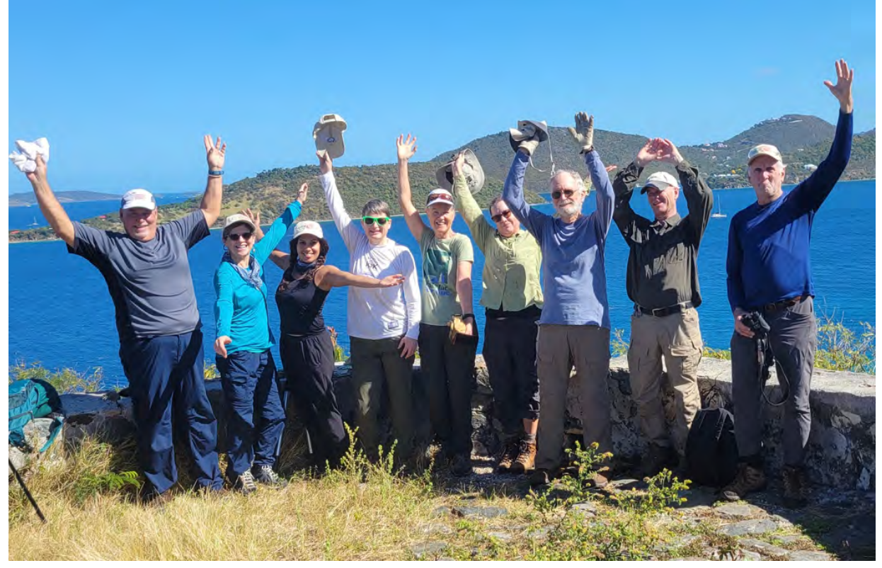
U.S. VIRGIN ISLANDS VOLUNTEER TRIP

The Virgin Islands National Park is a wonderful place to volunteer. Conservation Volunteers International Program's volunteer trip in the Virgin Islands offers an exciting opportunity to protect a national and international treasure. Volunteers help Virgin Islands National Park improve and maintain trails and restore fragile natural resources, while enjoying vistas of the beautiful Caribbean. The volunteers are teamed with experienced leaders who provide training in all aspects of the work so no prior trail maintenance or restoration experience is required.