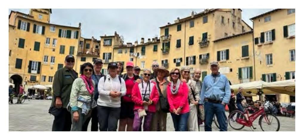
VOLUNTEER TRIP DATA