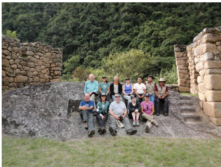
Volunteers and Rangers at Chachabamba Archaeological Site