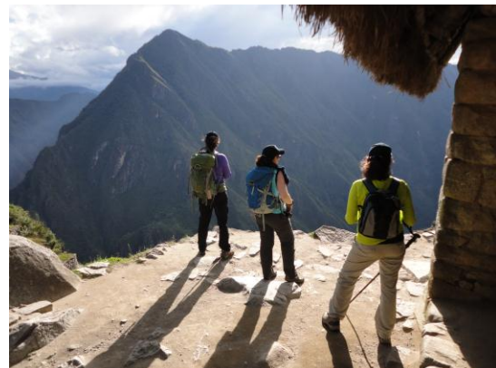
Volunteers visiting Machu Picchu for educational background information to prepare for work at Chachabamba.