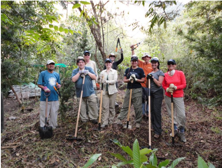
Volunteers cleaning weeds at Native Plant Nursery, Chachabamba

3. Removed invasive weeds and shrubs, cleaned and swept 100 meters of trail within the Orchid Sanctuary which is managed by SERNANP and volunteers from the Municipality of Machu Picchu Pueblo.