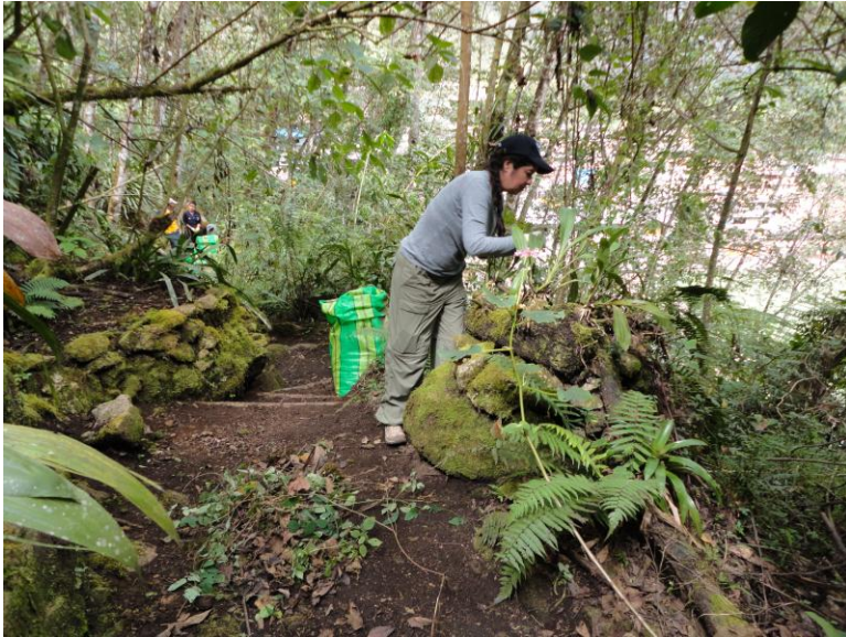
Volunteer working in Orchid Garden in Machu Picchu Pueblo

conducted. All of the tools were counted, and the list was determined to be correct. It was decided that the volunteers would assist the SERNANP staff at Chachabamba by removing weeds and shrubs around the periphery of the Native Plant Nursery on June 14, 2013.